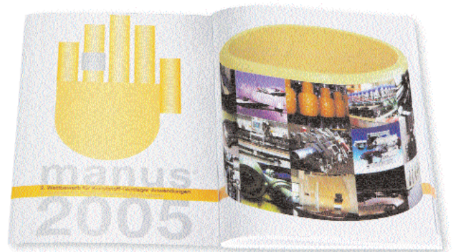
Picture PM 1605-02: igus® GmbH, Cologne Plastic plain bearings: 76 pages of tips for design engineers